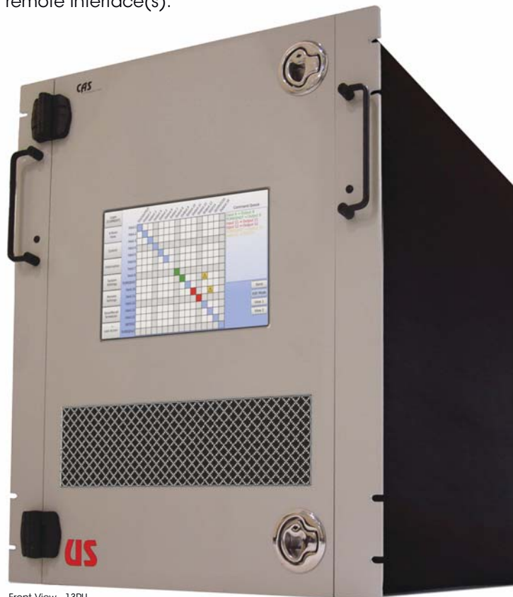
Front View - 13RU

Complete control and monitoring of the unit is available at both the intuitive touchscreen front panel, or any of the remote interface(s).