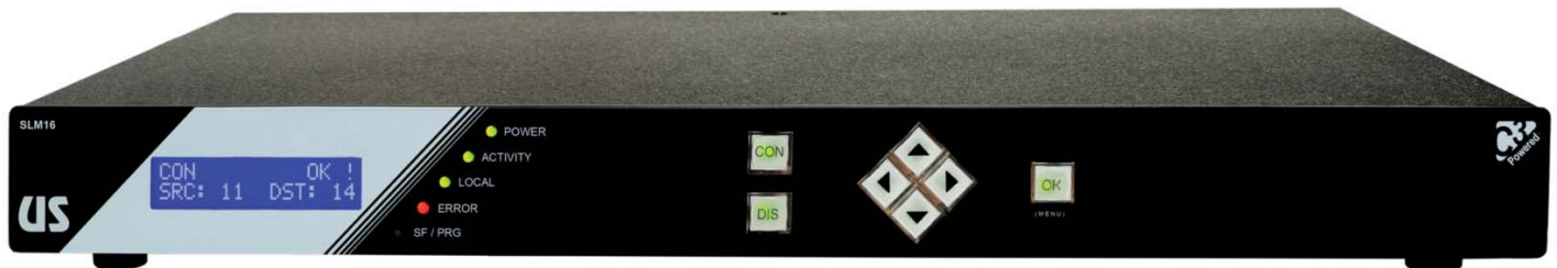
Model SLM16 L-Band 16x16 1RU